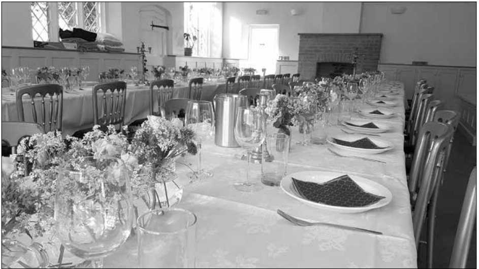
The Old School in May set up for a party of 60.

Lunch and Launch was on June 6th. Baguettes, strawberries and cream and Pimm's were on offer. The launch was for our latest book on Abthorpe, A Village of Peculiar People . More details on page 8.