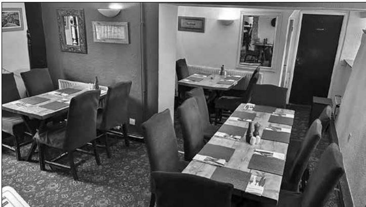
New tables in the New Inn