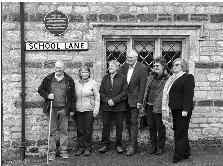
The unveiling of the Blue Plaque was attended by two former pupils of the school.