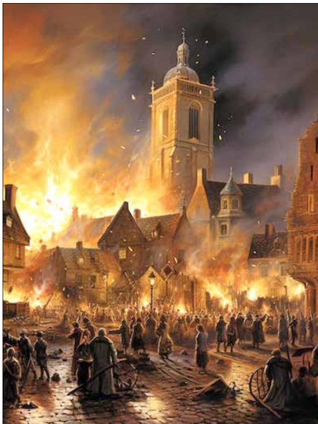
Artist's impression of the Great Fire

While the Great Fire of Northampton caused immense destruction, it also marked a turning