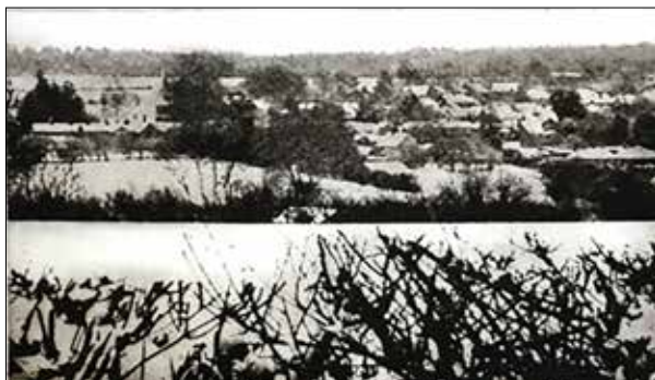
'Snowy Rooftops' - Towards Abthorpe