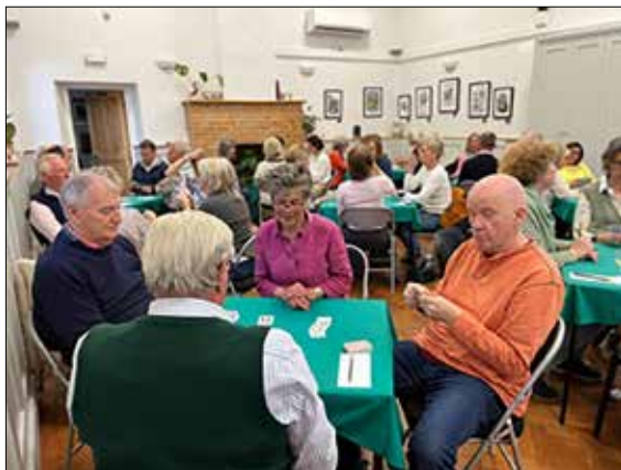
Bridge at the Old School

Keep checking the village Facebook page for dates and further details of all these events or see www.abthorpeoldschool.com .