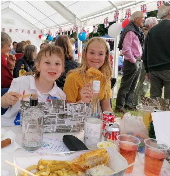
Two youngsters enjoying their fish and chips!

With appetites sated courtesy of the Howes Fish and Chip vans, we eagerly awaited the climax of the evening - the lighting of the beacon and the Grand Proclamation.