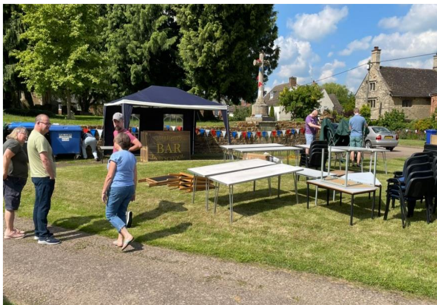
Setting up was well supported by volunteers from the village