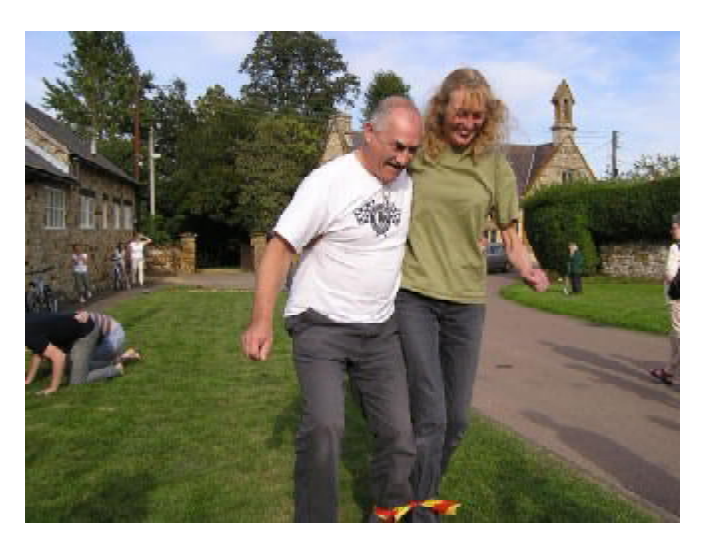
Three-legged race (not quite) winners romping home, but spare a thought for the team in a heap on the grass

The Village Fund is holding its first AGM on Thursday 2 November in the Old School. Please come along to hear the chair's and treasurer's reports, and contribute your comments on the Fund.