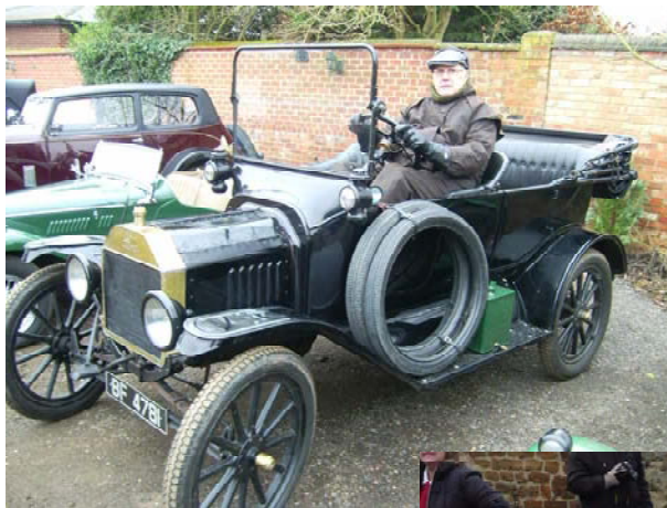
Model T Ford

The cars speak for themselves, ranging from a left-hand-drive 1916 Model T Ford, a spartan JAP-engined Morgan three-wheeler, to an outrageous Lea Francis with an aircraft engine.