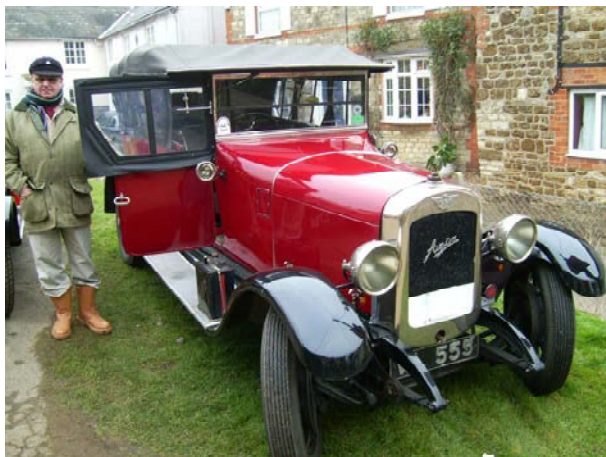
1926 Austin 20