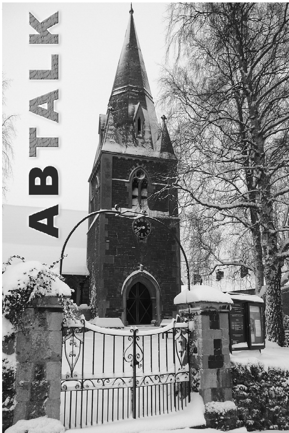
News from Athorpe March 2009