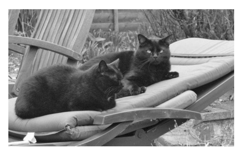
Guinness (on the right)

A very interesting idea is being hatched by the Northamptonshire Adult Learning Service and the NHS. A national website is being put together to gather information on classes, clubs or groups so that people reaching a change point in their lives can be encouraged to try