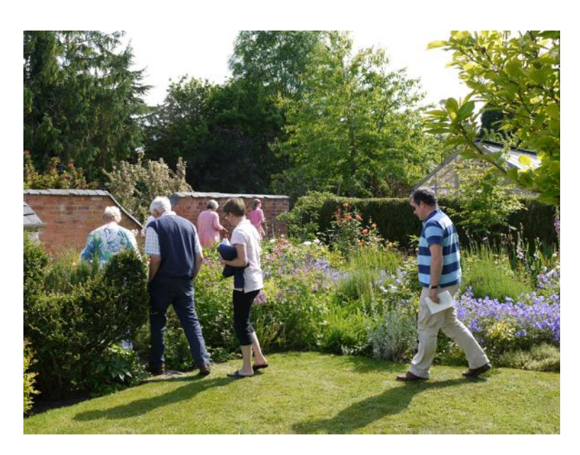
Stone Cottage garden, Main Street