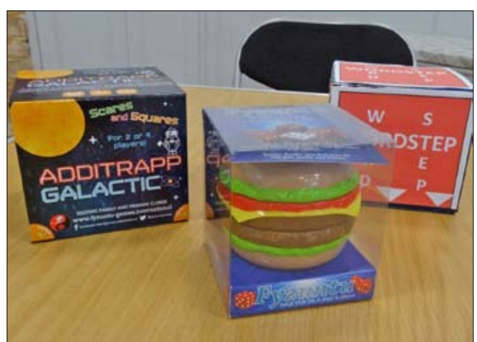
Examples of innovative games

soup (suitable for vegetarians), jacket potatoes and sausage or bacon butties. If anyone in Abthorpe just happens to have been born on 29th February, they can claim a free lunch (providing there is documentary evidence!)