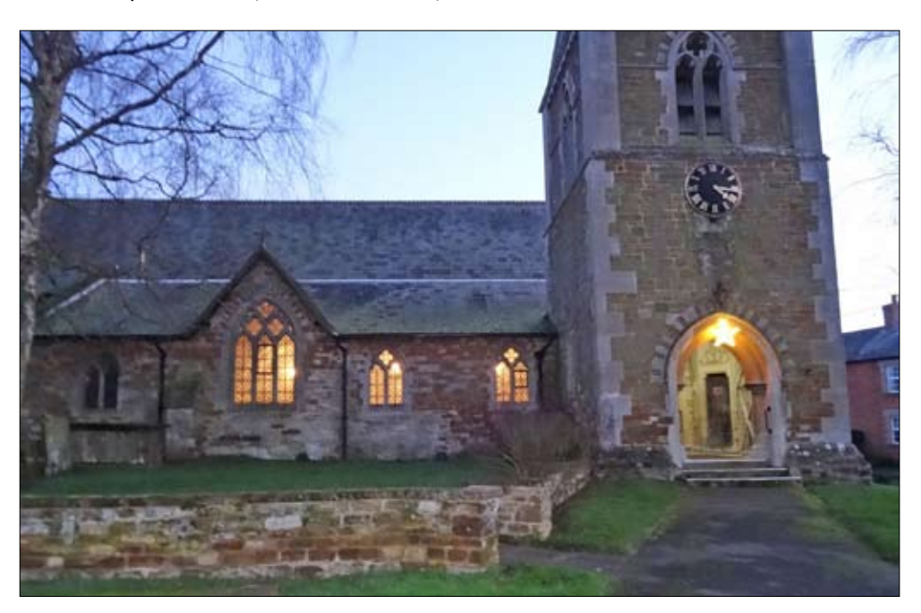
North entrance to a brightly lit Church

It would seem that 1st December is now being recognised as the start of the Christmas season for no sooner had the first windows of the advent