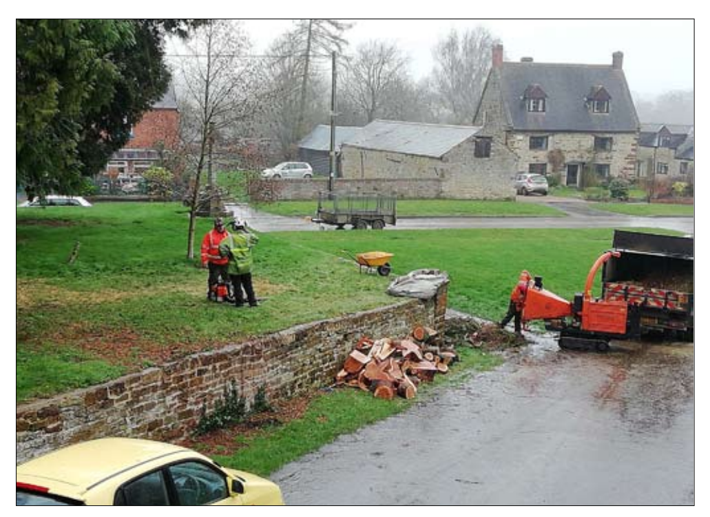
And, incidentally, looking at these photos showing the Green is a reminder about......