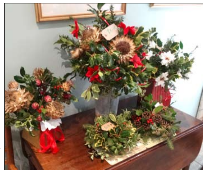
Floral displays on offer at Christmas Coffee Morning

Not happening in our village, but open to Abthorpe children, is a Maundy Thursday Children's Activity afternoon, which will be held in