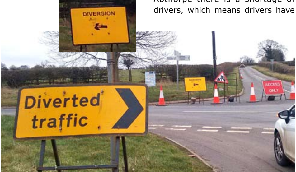
Recently seen during the road closure to Silverstone. What is the difference between Diversion and Diverted Traffic?

For the first time in over 30 years the charity has a waiting list of over 100 for membership due to a shortage of volunteer drivers. There are a number of areas and villages in the TADD catchment area, including Abthorpe there is a shortage of drivers, which means drivers have