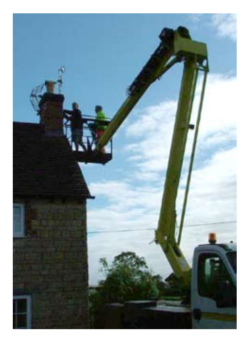
Broadband installation in action at Lower Green, Woodend with Keith Fenwick and Tim the cherry picker driver contending with high winds and occasional shower.

In May Bam Nuttall issued an open letter about the completion of the roadworks which have at least put Abthorpe on the map.