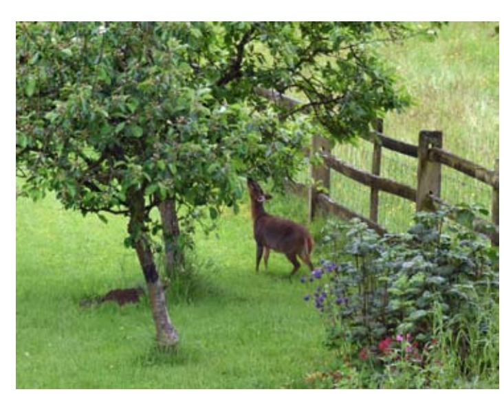
This Muntjac was caught taking lunch in Keith Fenwick's garden last April. The rest of the plum tree has survived.

It is apparently the biggest such event in the country for anyone with a love of wheels: cars, motorbikes or cycles, with demonstrations, stunt riders and participative activities for all ages, including a chance to drive a lorry around the circuit. There is a police-assessed ride and track experience which can be booked at www.bikesafe.co.uk, which is also the address for full information.