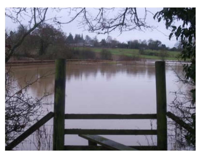
The Tove in flood

How fortunate we are that our village has been built on higher ground above the Tove flood plain. The flooding this year has been noteworthy, but sadly as the Environment Agency's measuring station on the Tove at